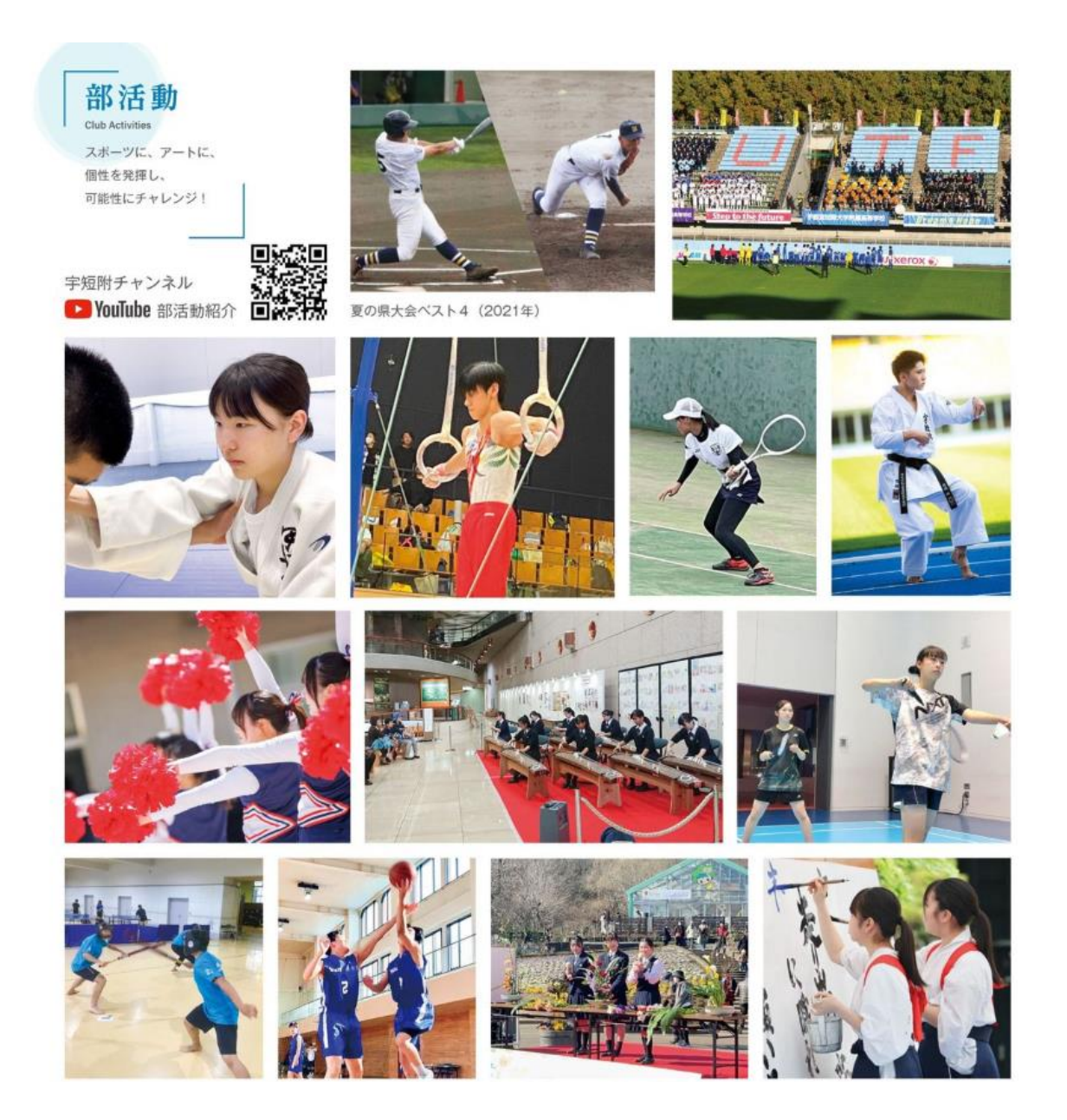
Clubs : Baseball / Kendo / Cheer Dance / Fashion and Handicraft / Pâtissier / Basketball / Judo / Track and Field / Marathon / Tea Ceremony and Flower Arrangement / Presentation and Debate / Table Tennis / Archery / Gymnastics / Drama / Karuta / Volleyball / Swimming / Rhythmic Gymnastics