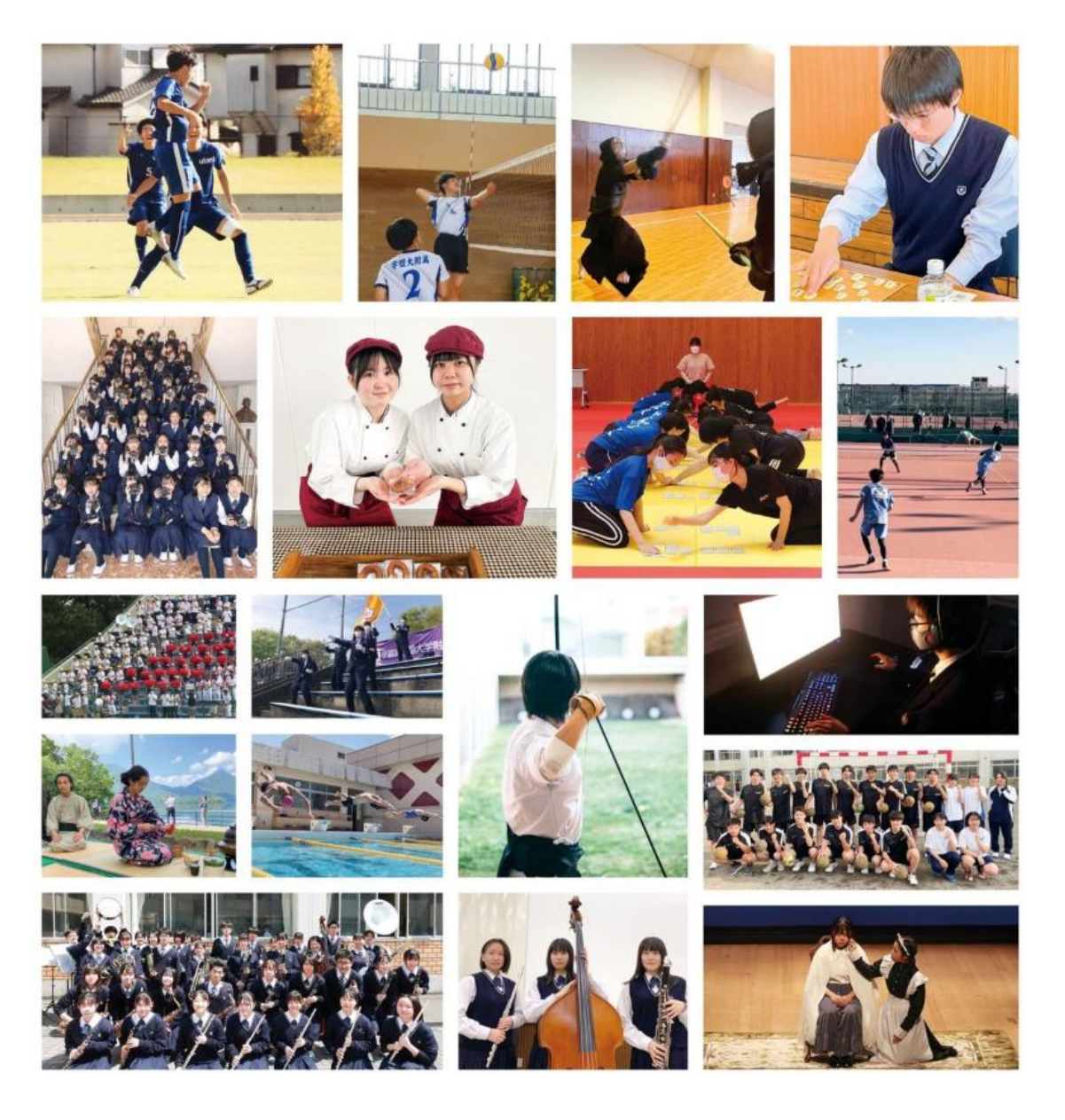
Brass Band / Illustration Art / Tennis / Football / Karate / Photography / Music / Soft Tennis / Badminton / Handball / Interact / Japanese Music / Sports Chambara/ Cheerleading / Boccia / Science / Soba / Go and Shogi / Magic / Choir / Agriculture / Calligraphy / YouTube and Metaverse / e-Sports